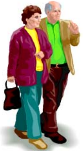
-- by Inez Wood